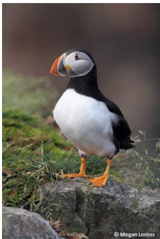
12 Atlantic Puffin

At sea, seabirds can be seen from the various ferries that cross the St. Lawrence Estuary, especially the Matane to Godbout, Quebec, ferry, the ferry from Cape Breton, Nova Scotia, to Port aux Basques, Newfoundland and Labrador, or the ferry from St. Barbe, Newfoundland and Labrador, to Blanc-Sablon, Quebec. In British Columbia, many seabirds can be seen from the Vancouver to Victoria ferry, especially in the passes between the Gulf Islands, where strong currents create good feeding conditions for the birds. A good way to see albatrosses and other oceanic birds is to take one of the whale cruises that operate from the west coast of Vancouver Island.