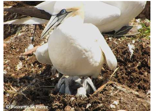
1 Northern Gannet