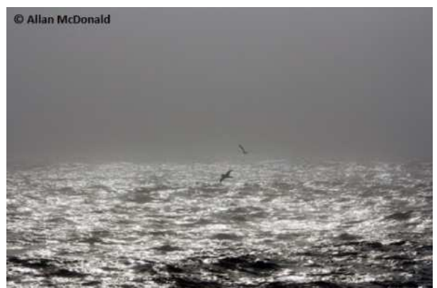
3 Sooty Shearwaters

True seabirds – those that spend all their lives at sea except when breeding – are among the most far-ranging of all birds. For example, Northern Fulmars in the Canadian high Arctic may travel more than 500 km from their breeding colony to find food during the breeding season, while the foraging trips of large albatrosses may cover several thousand kilometers. Oceanic seabirds are amazingly unaffected by storms and waves. The large albatrosses are actually dependent on strong winds to allow them to glide the enormous distances that they need to cover in order to find their food. However, a prolonged period of adverse weather conditions, especially in winter, can exhaust the energy reserves of some birds, resulting in their being