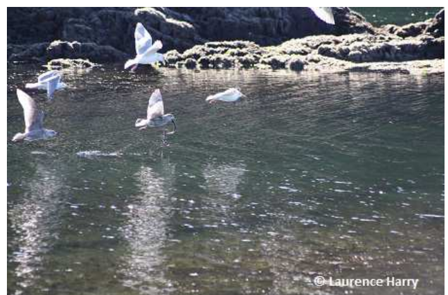
6 Herring Gulls feeding

Most seabirds feed either on small fishes or on zooplankton, the small, mainly crustacean, or shelled organisms that browse the oceans' primary producers, the microscopic plants called phytoplankton. Seabirds tend to be generalized in their diet, taking a wide spectrum of different sizes and types of prey. However, while rearing chicks they are more selective. Murres and puffins, for instance, take a very diverse diet, but feed their chicks exclusively on fish. In some situations a particular species of fish may become dominant in the diet. In the northwest Atlantic, for instance, the capelin, a small schooling smelt, is important to most seabirds, as well as to cod and marine mammals. In the Arctic, the Arctic cod,