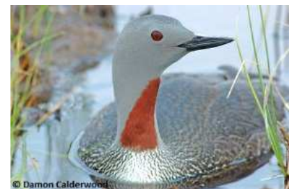
8 Red-throated Loon

Seabirds and their eggs have been an important source of food for coastal people around the world for millennia. Some communities, like that of St. Kilda in the western isles of Scotland, were almost totally dependent on harvesting seabirds. In Canada, seabirds were an important constituent of native diet in British Columbia, in Newfoundland and Labrador, and throughout the eastern Arctic, where every major colony is accompanied by archaeological remains attesting previous use. In the Arctic, the Thick-billed Murre was the most commonly taken species. At Digges Island in northern Hudson Bay, one of Henry Hudson's crew described finding stone huts