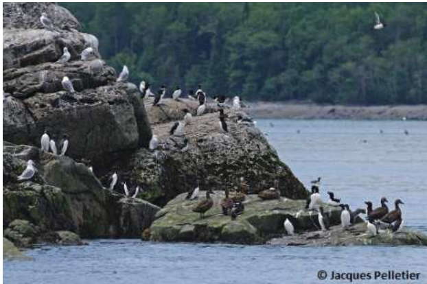
4 Several species of seabirds in a colony

washed up exhausted on beaches, or even driven far inland. Certain species are famous for such periodic "wrecks." In eastern North America showers of Dovekies appear inland at irregular intervals, apparently as a result of an adverse combination of strong winds and poor food supplies.