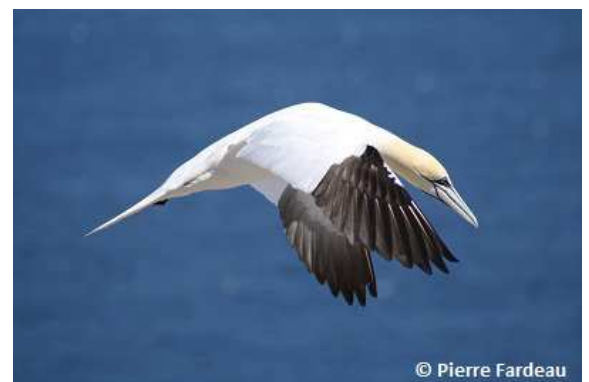
5 Northern Gannet

As well as underwater swimming, many seabirds, such as storm-petrels, terns, and jaegers, feed at the sea surface, seizing prey in flight. Others, including kittiwakes, phalaropes, and Northern Fulmars, feed while sitting on the water. Species such as gannets, boobies, pelicans, and terns use the impetus derived from plunging vertically into the sea to carry them underwater. Gannets dive from heights of up to 50 m above the surface to reach depths of as much as 15 m. However, most seabirds feed within 1-2 m of the sea surface, gleaning floating material, or feeding on organisms swimming at very shallow depths. Differences in feeding techniques have led to a variety of seabird designs. The following drawing shows the