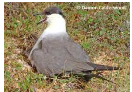
10 Long-tailed Jaeger

In Canada, especially in Newfoundland and Labrador, the setting out of monofilament gill nets, which are less visible than other nets, for cod and salmon can result in the entanglement and drowning of seabirds. Murres and Razorbills are particularly vulnerable to this type of tragedy and hundreds are sometimes killed in a single net, especially if it is left in the water overnight. Nets which are lost in storms may drift for years in the ocean – a constant danger to unwary seabirds. Fragments of nylon fishing nets are also used by gannets in nest building and some chicks become entangled in such wastes.