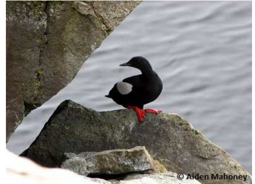
11 Black Guillemot

The kittiwake, puffin, and murre colonies on islands in Witless Bay and at Baccalieu Island in Newfoundland and Labrador are visited by regular tourist boats. These boats operate from nearby fishing ports, respectively, Bay Bulls and Witless Bay, just south of St. John's, and Bay de Verde at the north end of Conception Bay. At the tip of the Gaspé Peninsula, in Quebec, the Northern Gannet and murre colony at Bonaventure Island can be reached by regular tour boats from Percé. Whether seen from the land or from a boat cruising below the cliffs, this gannetry is truly awe-inspiring.