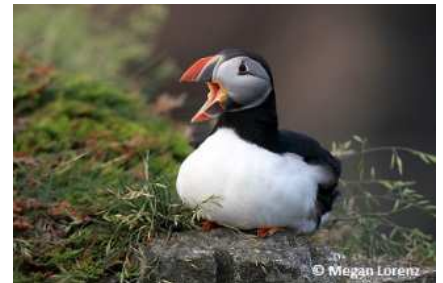
7 Atlantic Puffin nesting

The general affinity between seabirds and cold water makes Canada a good place for seabirds to live. Fifty species breed here and a further 20 or more that breed elsewhere feed in Canadian waters for part of the year. On a world scale, Canada is especially well endowed with loons, phalaropes, jaegers, and auks. The coast of British Columbia supports more than half the world population of three auks: the Ancient Murrelet, Cassin's Auklet, and the Rhinoceros Auklet.