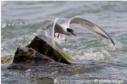
2 Common Tern

Everyone who has visited the coast is familiar with gulls, those graceful, long-winged birds that throng the beaches and harbours and boldly beg for scraps. The gulls are a family of birds that live mainly at sea, either along the shore, or out in the ocean itself. Worldwide, there are more than 350 species of birds that live either partially or exclusively at sea, and these are generally known as "seabirds."