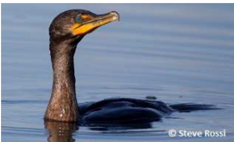
9 Double-crested Cormorant

Seabirds, like most of the world's animals, have suffered enormous disruptions to their habitats and populations as a result of the human tendency to use most of Earth's resources for ourselves. Direct harvesting, especially during the period of the great European mercantile expansion in the 16th to 19th centuries, led to the extinction of the Great Auk in the Atlantic and of Pallas' Cormorant in the Pacific, as well as the reduction or extirpation of many local seabird populations.