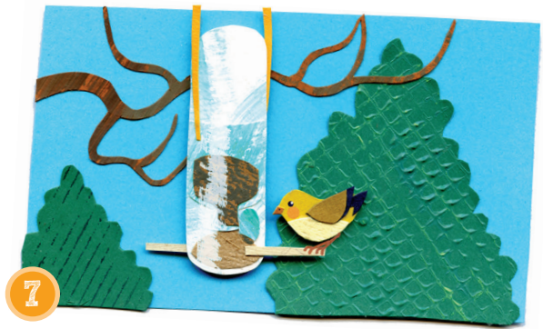
Your bird feeder is almost ready. All you have to do now is turn it over slowly and find a good place to hang it. You can also decorate your feeder with markers. Have fun!

Push the bottle with the birdseed into the bottle with the holes, stick and string. Keep pushing until the bottle with the birdseed touches the stick.