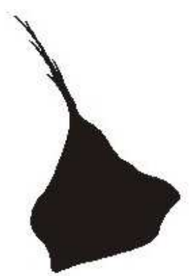
Ear of Canada lynx

Of the three Canadian members of the cat family (Felidae)—the lynx, the bobcat, and the cougar—the lynx and the bobcat are most alike and are most closely related to each other. They probably both descended from the larger Eurasian lynx. There are small differences in appearance: on average, bobcats are slightly smaller; the bobcat's feet are not as large as those of the lynx, making the bobcat less able to secure food in deep snow; the lynx's tail has a solid black tip, whereas that of the bobcat has three or four narrow black bars and a black spot near the tip on its upper surface; and the bobcat's fur has more pronounced spotting. The cougar is much larger and more powerful than either of them, and can be readily identified by its long tail.